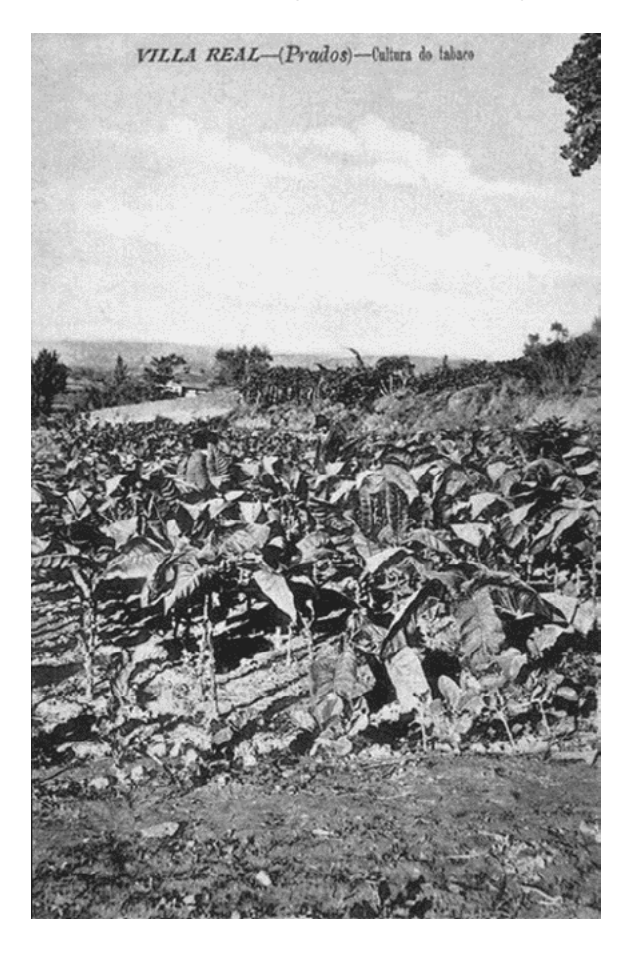
Figure 3. Tobacco plantation in Vila Real (Douro Region). Postcard, late 19th century Figura 3. Plantación de tabaco en Vila Real (Región del Duero). Tarjeta postal, finales del siglo XIX