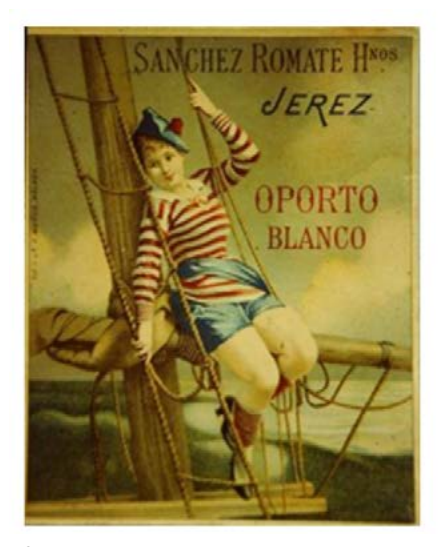
Figure 4. Port wine labels produced outside the demarcated Douro region, even outside Portugal Figura 4. Etiquetas de vino de Oporto producido fuera de la región demarcada del Duero, incluso fuera de Portugal

At the same time as the regional claims, the law on industrial and commercial trademarks of 4 June 1883 was approved in Parliament. Integrating trade marks within the scope of industrial property law, this law sought to create guarantees of fair competition in the exercise of economic activity, preventing fraud and forgery.